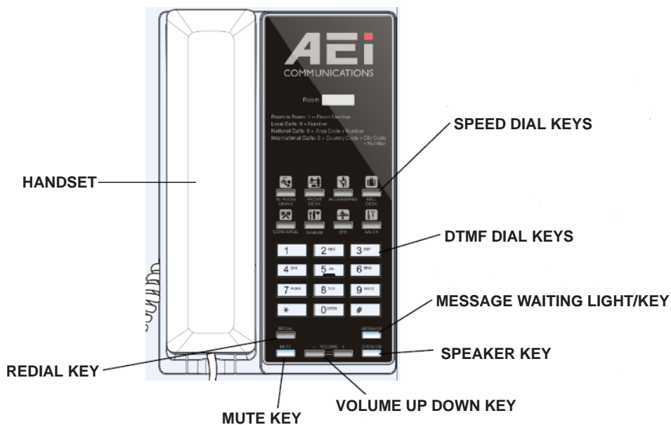
VM-6108-S DIAGRAM (FRONT)